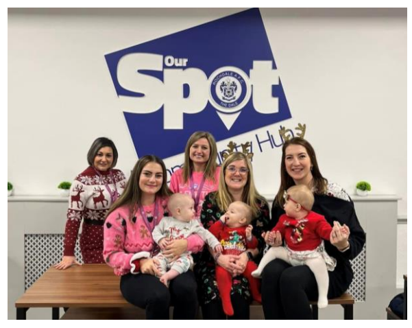
Rochdale and Oldham Maternity Voices Partnership Volunteer Advocates pictured at their Christmas gathering at "Our Spot"