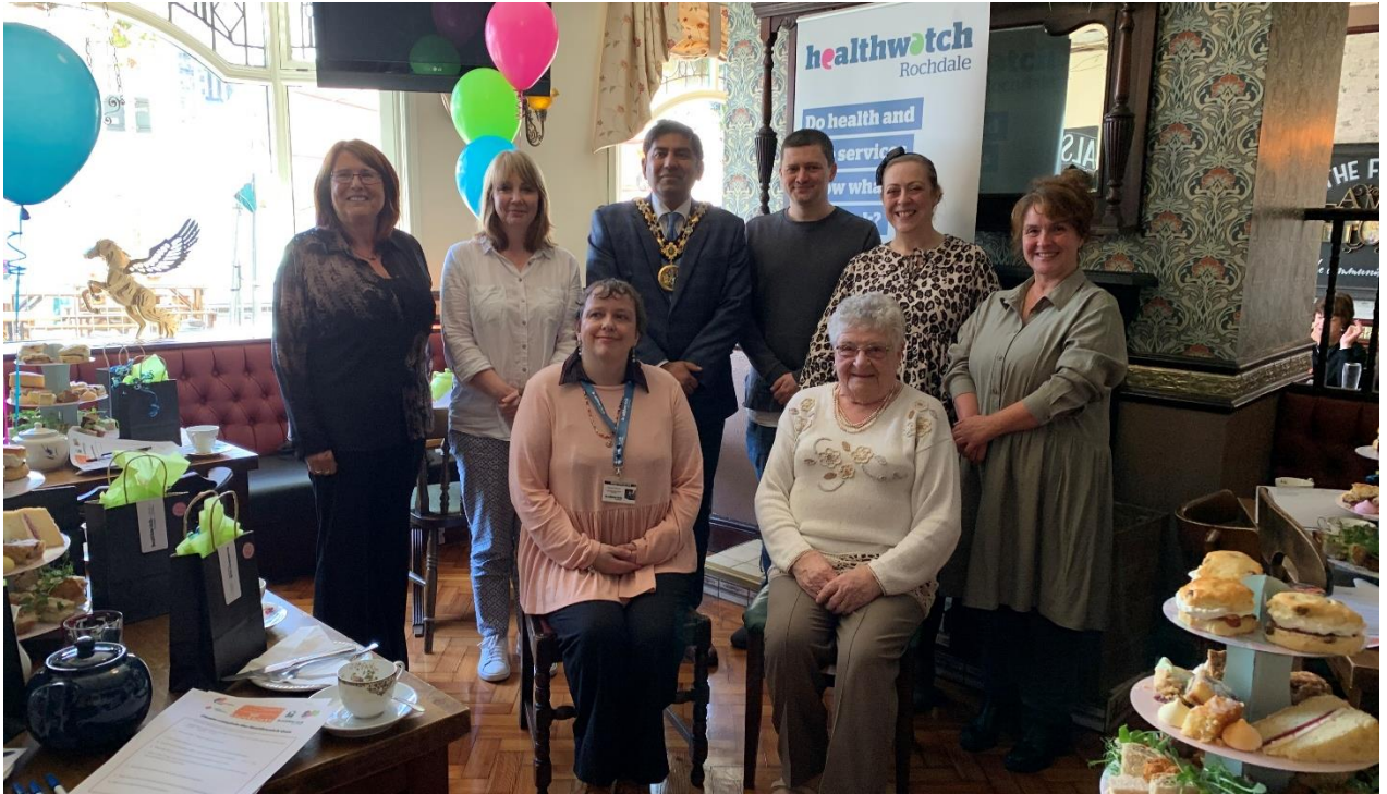
Healthwatch Rochdale staff and Volunteers pictured with the Mayor of Rochdale at their "Volunteer Thank you" Event at The Flying Horse, Rochdale.

Healthwatch Rochdale received a grant from Action Together to host an event to thank their Volunteers for all that they do for our organisation and to bring them back together after a very uncertain year due to the Covid-19 pandemic.