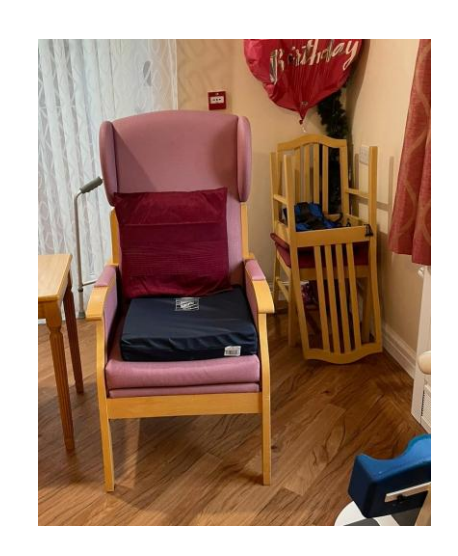
Safety concern: chair stack

On the day of the visit some walking frames were situated in the hallway when the residents were in the lounge additionally in one lounge there were chairs piled on top