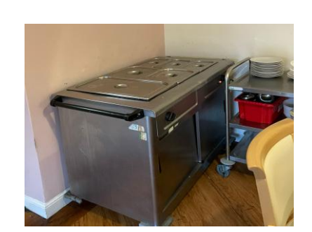
Hazard: Bain Marie with no hazard notice

There was no visible menu board on display. However, staff said they ask residents what they want, and that liquidised and soft meals are provided to meet individual resident needs. However, the kitchen staff said none of the current residents require halal or gluten free food. When the lack of a menu was questioned, we were informed that new kitchen staff had been employed and said menus had recently been reviewed. It was confirmed that they do have small frames in the dining areas in which they usually display weekly menus, and they will action this recommendation as soon as possible.