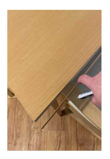
Hazard: table edging hanging off

The lunch was served at 12.30 pm in the dining areas. The chairs were wooden with wipeable seats and arm rests with legs that ensured they were stable and not tip over, but it was observed that four of the chairs were wobbly alongside one