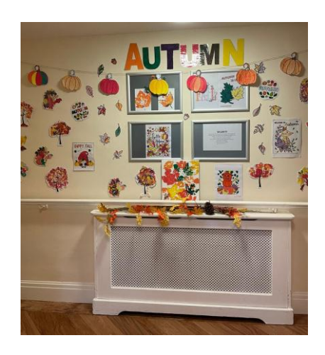
Art display at the Lyndhurst

http://www.legislation.gov.uk/uksi/2012/3094/regulation/44/made