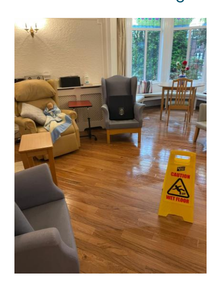
Cleaning the dining room

However, housekeeping staff were also observed cleaning all three lounges whilst the residents were having lunch, taking care to mop the areas, empty bins, wipe