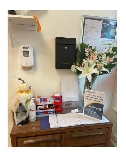
Reception area with Healthwatch notices